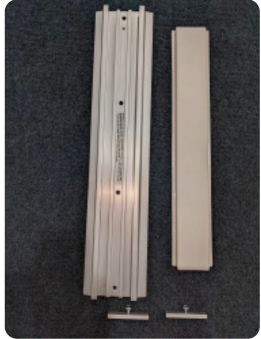
GCX Channel, Stops, and Wire-Shroud *GCX Channel should already be installed on customer's wall and will generally not be included.